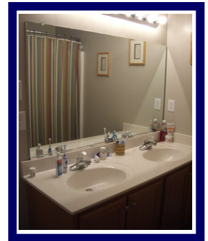
Double Sinks in Second Bath