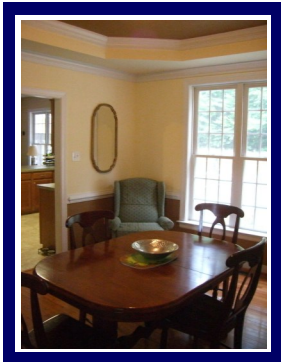
Dining Room with Tray Ceiling